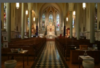
Our Lady of the Holy Cross