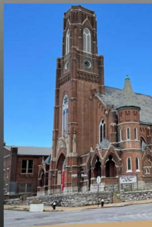
St. Elizabeth, Mother of John the Baptist