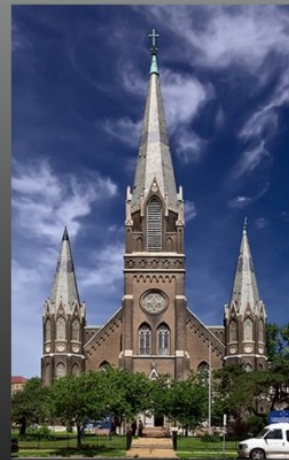
St. Matthew, the Apostle